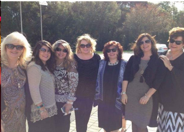
All the Brady Ladies, Sisters and Wives