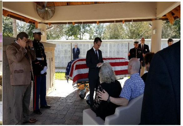
Graveside Military Service for an honored Marine